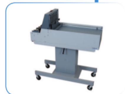
Optional V-Stack36 Vertical Stacker with adjustable-height stand