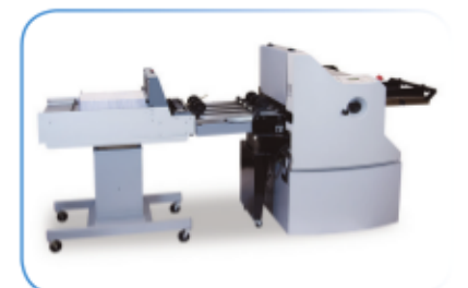
FD 2094 in-line with optional V-Stack36 Vertical Stacker and adjustable stand