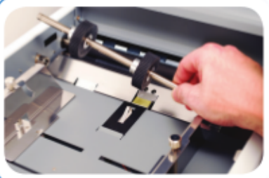
Removable Feed Wheels