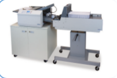
FD 2054 in-line with optional V-Stack36 Vertical Stacker, stand and cabinet