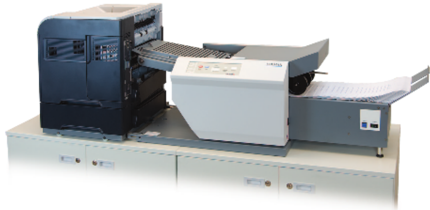
FD 2002IL System shown with IL Pressure Sealer and Alignment Base, laser printer (not included), and optional locking cabinets and 18" conveyor