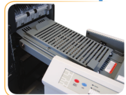
Enclosed paper path provides optimal document security