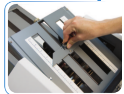
Pre-marked adjustable fold plates