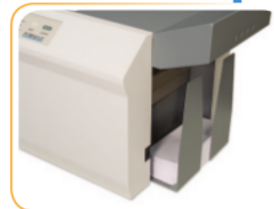
Standard Catch Tray