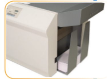
Standard Catch Tray

The FD 2002 processes forms at a rate of up to 8,000 sheets per hour and can hold up to 250 - 24# forms in the feed hopper. This makes the FD 2002 an economical and reliable solution for departmental post processing.