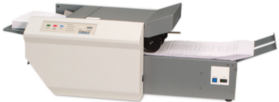
Shown with optional 18" conveyor

The FD 2002 AutoSeal® pressure sealer is a powerful desktop model designed to process pressure sensitive self-mailers. An easy to use touch-pad control panel and three-roller drop-in feed system make this product both practical and dependable. Its redesigned sliding fold plates make setup and operation even easier, with fine tuning knobs for precision folds.