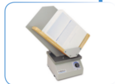
402 Series Jogger - an option which reduces static electricity from forms and aligns them for proper feeding