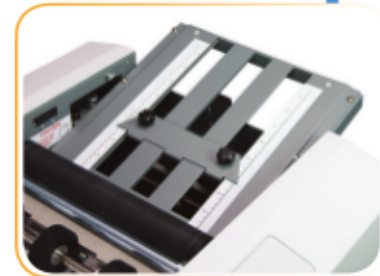
Redesigned fold plates - Clearly marked and easier to adjust

The FD 1502 is designed for user friendly operation. Simply set your folds according to the clearly marked settings on the fold plates, load your forms using the drop-in feed system, press start and you're on your way. The FD 1502 has LED indicators for power on, fault detection, paper out and cover open. It also includes a six-digit counter for audit control.