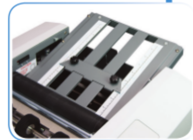
Redesigned fold plates - Clearly marked and easier to adjust