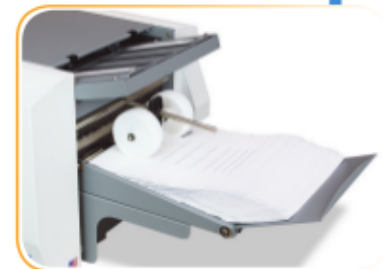
Integrated Output Conveyor

The FD 1502 Plus is designed for user-friendly operation. Simply set your folds according to the clearly marked settings on the fold plates, load your forms using the drop-in feed system, press start and you're on your way. The FD 1502 Plus has LED indicators for power on, fault detection, paper out and cover open. It also includes a six-digit counter for audit control and an integrated output conveyor.