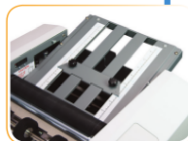
Redesigned fold plates - Clearly marked and easier to adjust